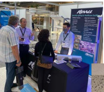
2' x 6' Floor Graphic $500 Placement in front of exhibitor's booth.

SEPTEMBER 15-16, 2022 ARCHLIGHTSUMMIT.COM