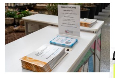
Full-Page Ad in Show Directory | $1K